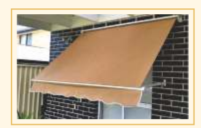
Drop Arm Awnings