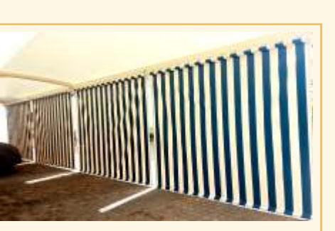
Verticle Drop Awnings